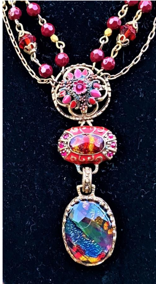
The Haunted Necklace. Now proudly on display!